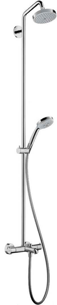
Croma Green Tub/Shower Showerpipe