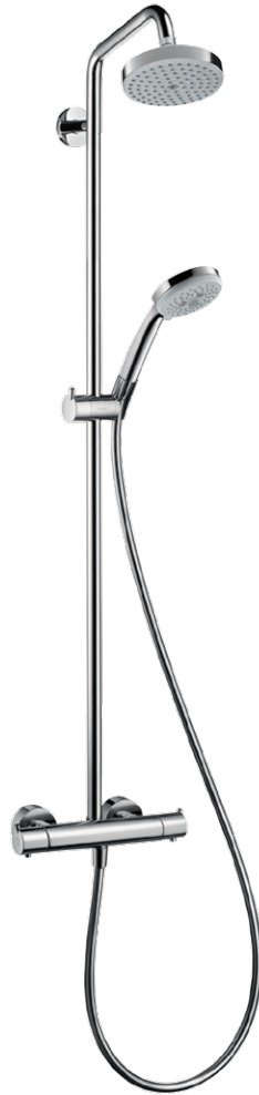
Croma Green Showerpipe, 2.0 GPM